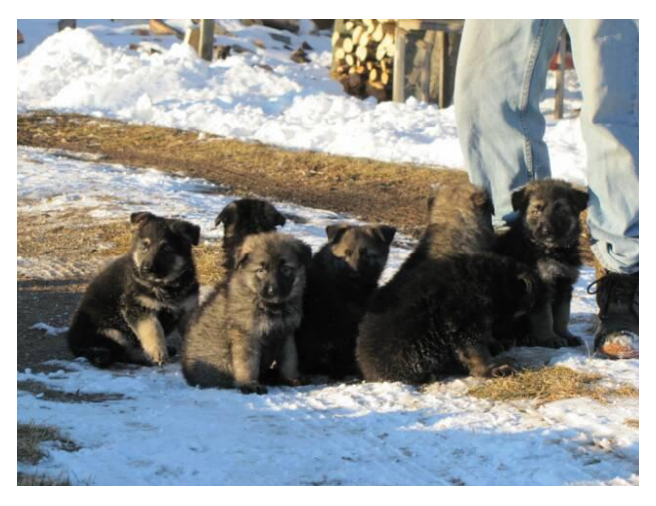
Nine puppies to choose from and every one cute as can be. My grand kids can't wait.