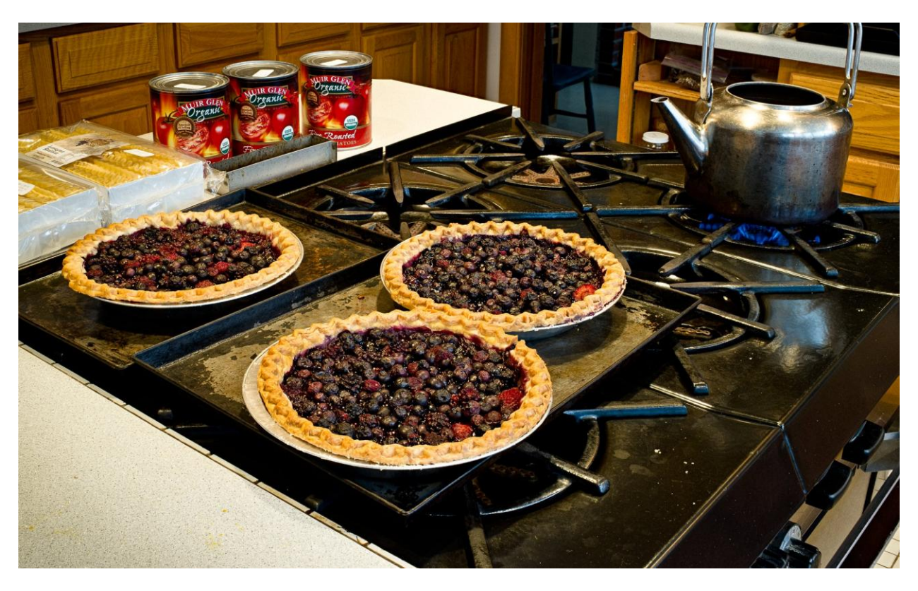
These are my berry pies folks. I like em'.