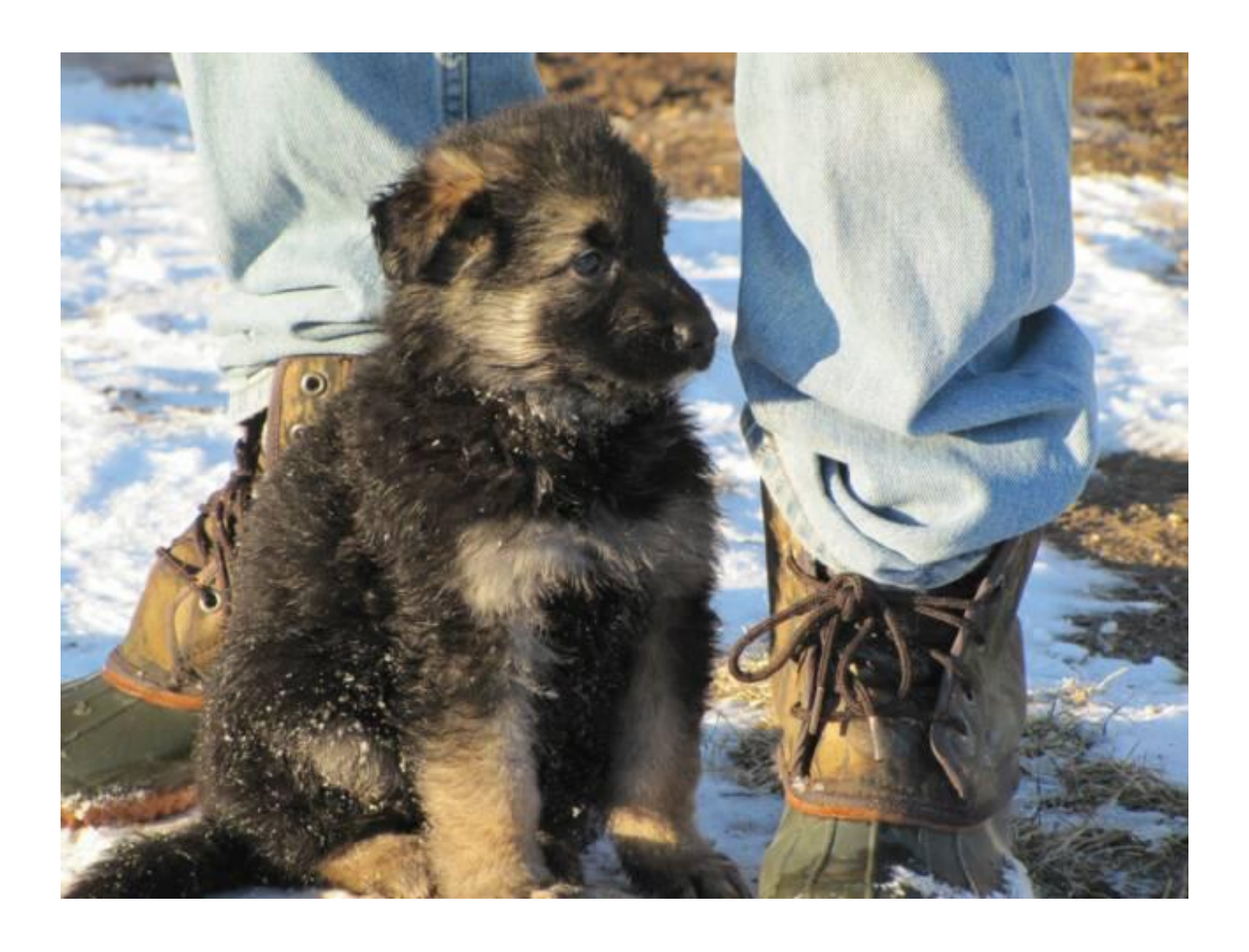
There is nothing like puppies and many of us have a puppy-foot fetish. Their little feet smell like no others.